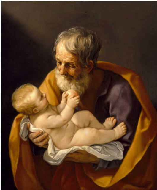
Guido Reni "St. Joseph and the Christ child"