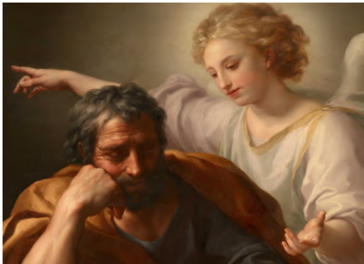
St. Benadino of Siena "St. Joseph's Dream"